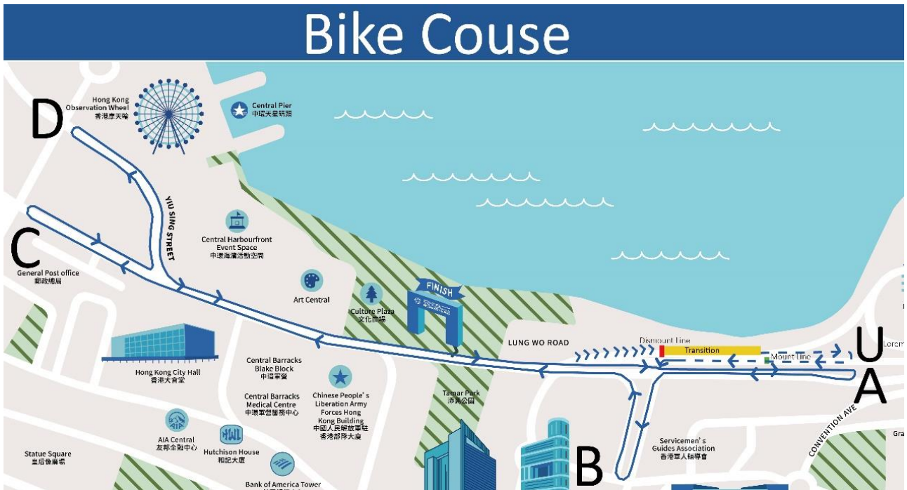
Bike 9km: (3 laps): Transition → U→(A→B→C→D) x 3 times → Transition