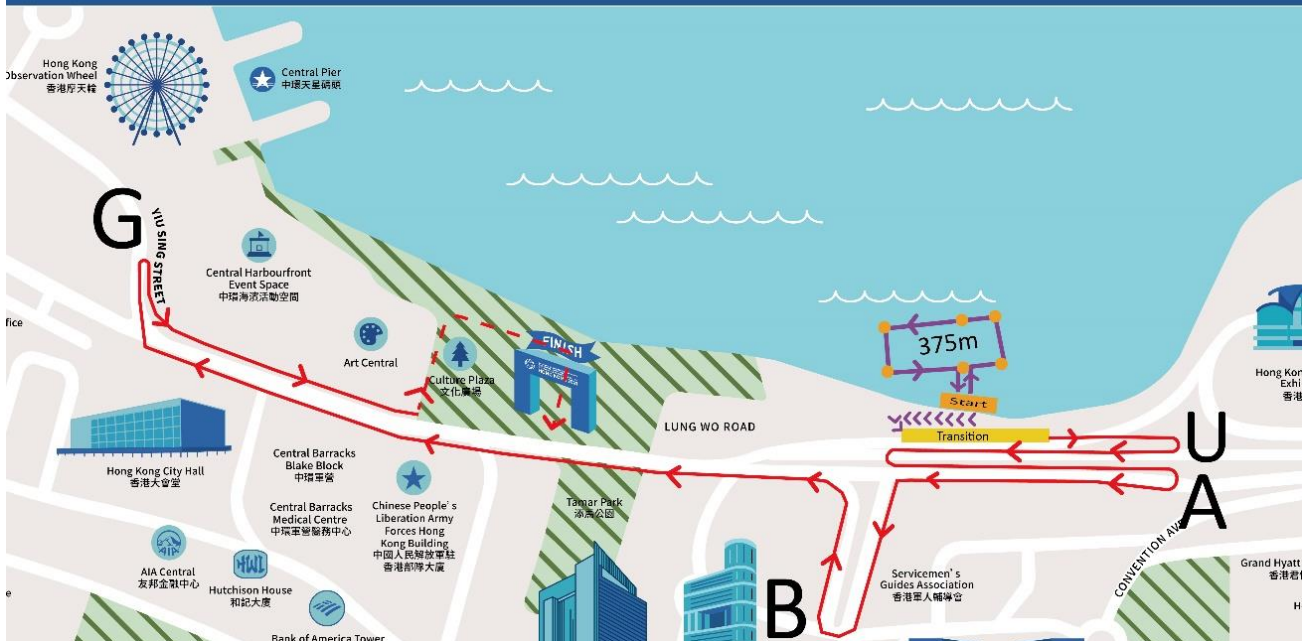
Run 2.5km (1 lap): Transition → U → A → B → C → G → Finish