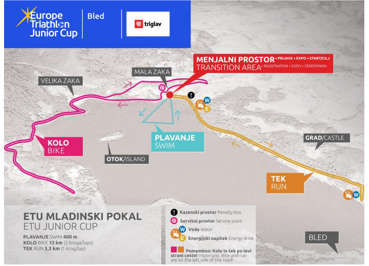
Location: Bled, Slovenia, Rowing center Mala Zaka. Župančičeva cesta 9, Bled