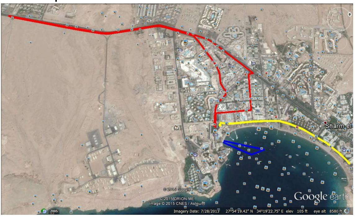
The Full Map